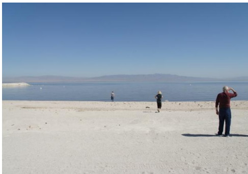
Photos: 1 . 20-ft high Joshua Trees and weathered granite hills. 2 standing in a dry waterfall with hanging boulder, Anaza-Borrego desert 3. Exploring the shore of the Salton Sea

EarthView.rocks ( http://earthview.rocks )