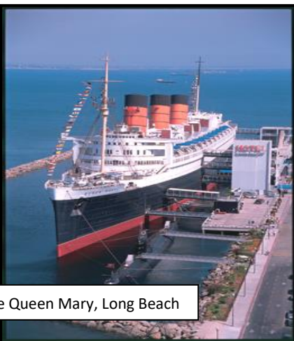
The Queen Mary, Long Beach

Days 5, 6, 7, -- Sun – Tues. – 3/11-13. Today we head north, toward Los Angeles. Our destination: the Queen Mary! Along the way we stop for lunch at the oldest building in California: the 200-year-old San Juan Capistrano Mission . Then on to the Queen where we will have porthole view rooms on this historic museum-ship berthed in Long Beach . What a treat to relive the grand days of cruising without leaving port. From this convenient base, we will explore Catalina Island , the scenic Palos Verdes Peninsula , and the interesting city of Long Beach with its world class Aquarium of the Pacific . An option would be the Huntington Museums , with world famous gardens.