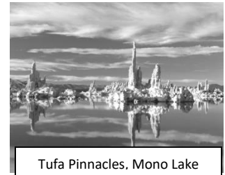
Tufa Pinnacles, Mono Lake

DAY 9 – 10 Sunday – Monday, Aug. 19 – 20. Explorations of Mono Lake and Devils Postpile National Monument . Volcanic phenomena are revealed! You will be surprised, delighted, impressed..... Short drives and hikes.